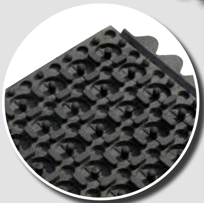
Draining lower side